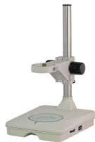
Pole LED #131-13-18