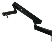
Articulating Flex Arm #15350