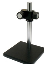
Pole Stand/Heavy Base #15349