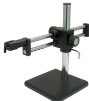
Ball Bearing Boom #15636-BB