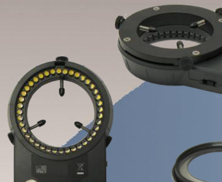
LINITRON° LED140 Ring Illuminator CAT# 15864

UNITRON's new "MADE IN THE USA" Ring Illuminators offer best in class brightness, versatility and stability. ESD safe, RoHS compliant, and best of all manufactured in the USA, these LED ring lights provide outstanding performance & value!