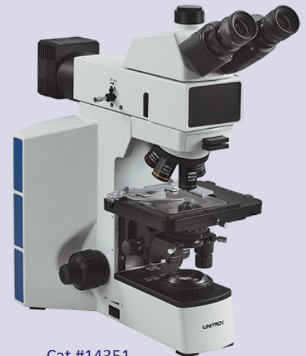
Cat #14351 Reflected & Transmitted