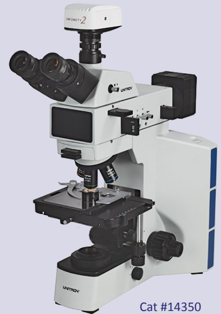
Cat #14350 Reflected (Shown with camera)