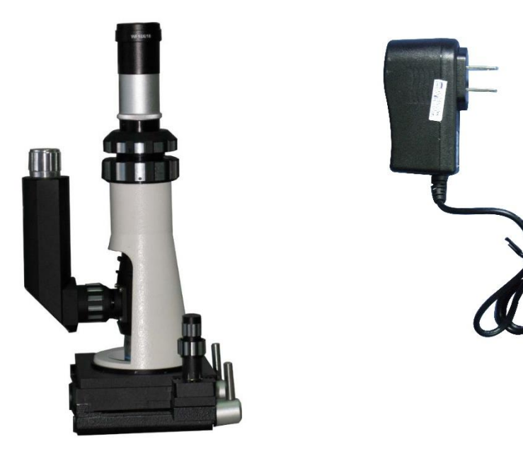
Magnetic Base (Optional for NYMCS-605, standard for NYMCS-606)

This illumination can be used continuously for forty hours after a charge, long working time, save energy, temperature rise is small, there is not much heat, safe to use.