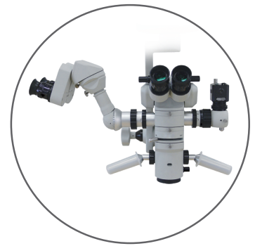
SRI Slim Image re-inverter system for vitrectomy surgery