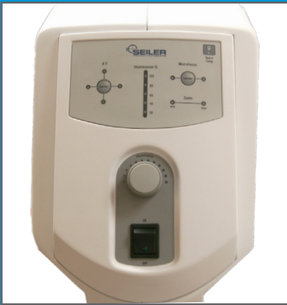
Electronic Control Panel