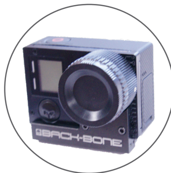
Hero 4 has been modified so you can select the right lens for a given shot and capture 1080P video.