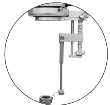
SeilerMax Adapter for use with wide angle, non-contact lenses