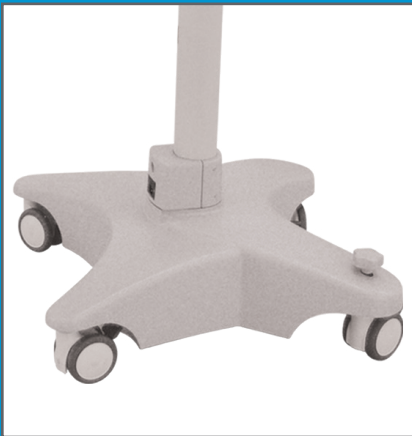
Stable floor stand with integrated wheels with blocking system and level adjustment knob