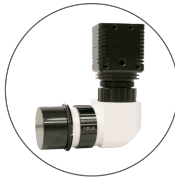
Video image capture system