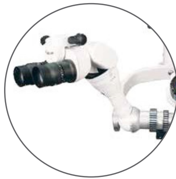
Binocular for second observer