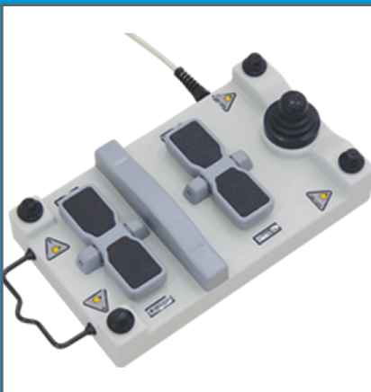
Multifunction foot pedal with on/off switch and illumination intensity, micro focus, zoom and XY device controls