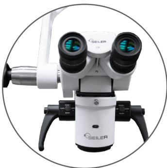
200° Inclinable binocular head