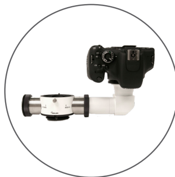
Easily attach any Sony, Canon, or Nikon DSLR camera directly to the microscope for high quality, razor sharp images.