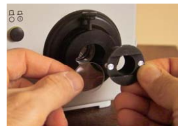
Bezel accepts filters too! Install IR and/or long term use filters here.