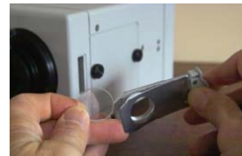
Filter drawer with holder. Install seldom or intermittent use filters here.

Some filters may be supplied with a protective plastic film covering the coating. BE SURE TO REMOVE THE FILM BEFORE USE!