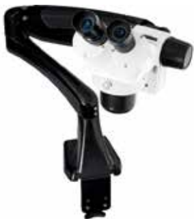
Z4 Zoom on Pneumatic Arm