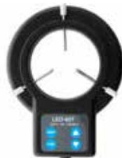
48 or 60 Bulb Variable LED Ring Light