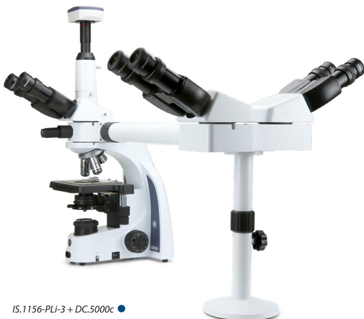
IS.1156-PLi-3 + DC.5000c ●