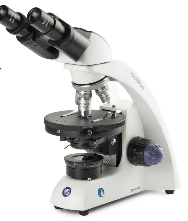
Polarization model BB.4260-P-HLED

APL is a revolutionary paint treatment applied to the most critical parts of our products. A microscope with APL will restrict the growth of micro-organisms, including bacteria and mold