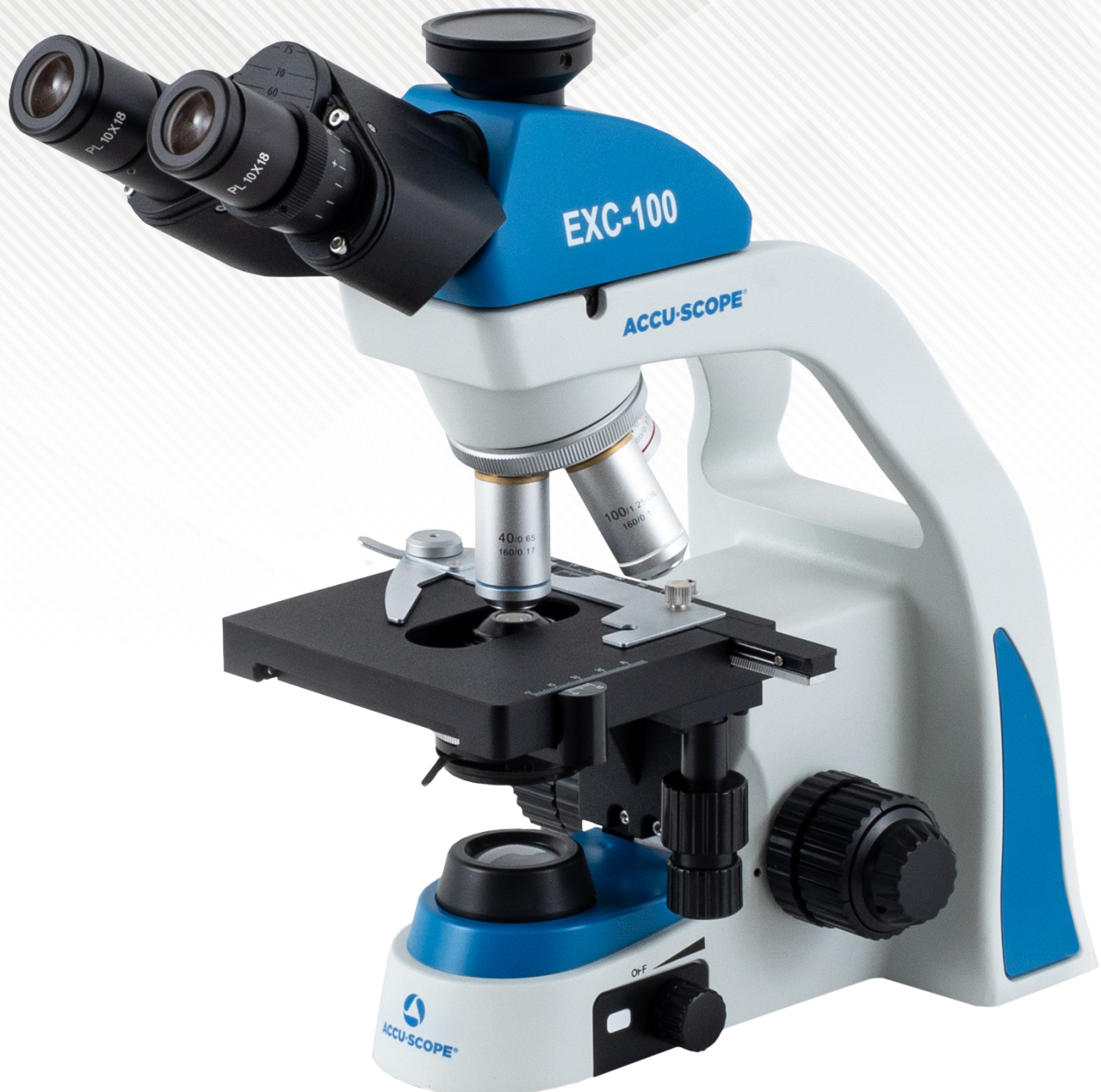
EXC-103 trinocular microscope

Empowering Discovery. Advancing Results.