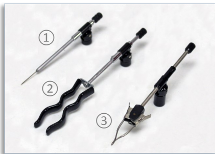
Accessories shown left:

Easily observe loose stones with the included wire stone holder, or view rings with optional the ring holder (sold separately).